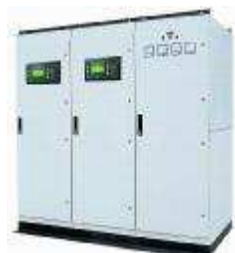
Paralleling Control System